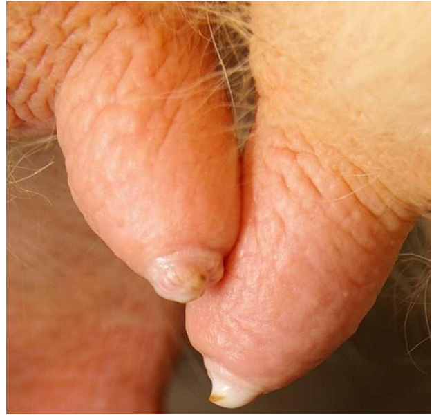
Scar tissue (hyperkeratosis) at the teat orifice is evidence of overly aggressive milking. The result: Destruction of natural infection barriers and frequent mastitis.

• When the rest phase vacuum is lowered, the teats that were previously stretched can retract again. If, however, the vacuum at the teat is